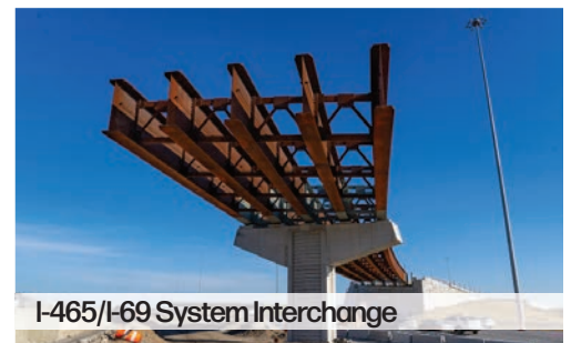
I-465/I-69 System Interchange