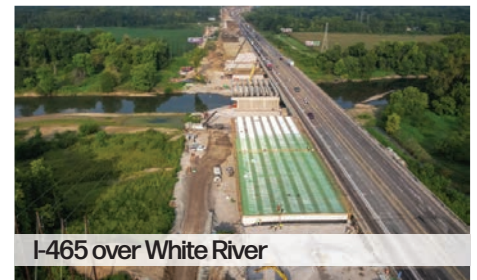
I-465 over White River