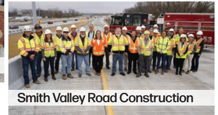
Smith Valley Road Construction