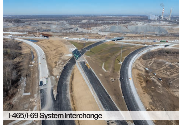
I-465/I-69 System Interchange