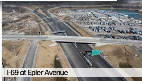
I-69 at Epler Avenue