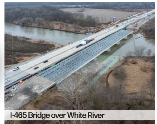
I-465 Bridge over White River