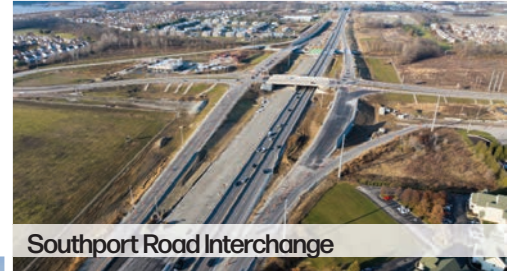
Southport Road Interchange