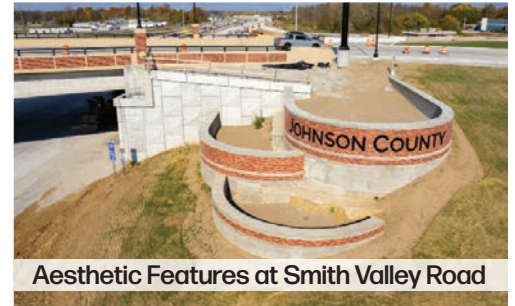
Aesthetic Features at Smith Valley Road