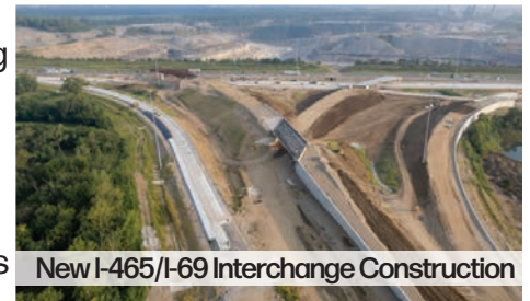
New I-465/I-69 Interchange Construction