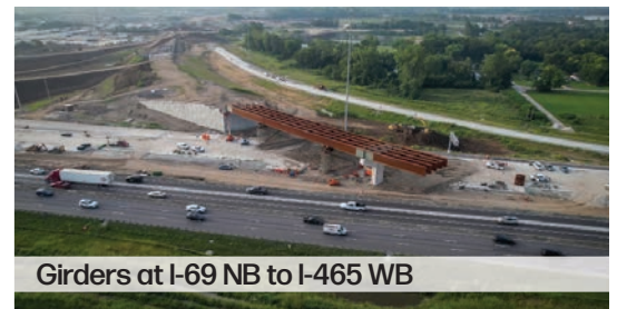
Girders at I-69 NB to I-465 WB

19,000 square yards of concrete pavement