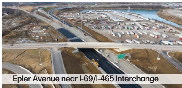
Epler Avenue near I-69/I-465 Interchange

128 concrete beams placed 177,400 tons of permanent asphalt pavement