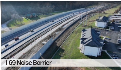
I-69 Noise Barrier