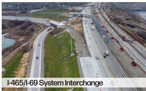
I-465/I-69 System Interchange